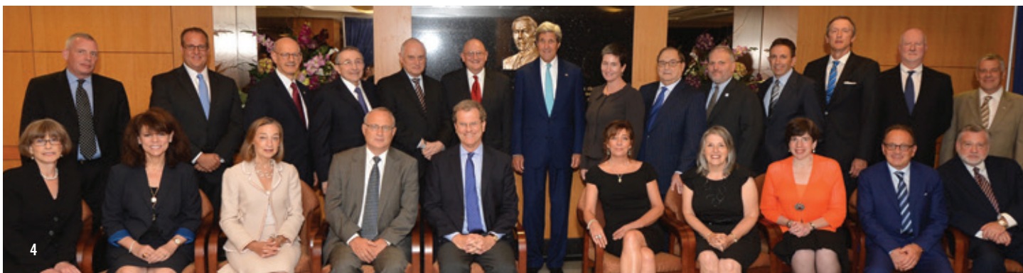
1 March 2014: Briefing with Ukraine Chief Rabbi Yaakov Bleich 2 February 2014: Druzya Young Leaders event at the Embassy of Israel 3 May 2014: NCSEJ special representative in Ukraine Ilya Bezruchko 4 September 2014: Roundtable participants in U.S. State Department forum on anti-Semitism

To donate by check or credit card, please call (202) 898-2500, visit www.ncsej.org and click "Donate," or mail your contribution to: NCSEJ | 1120 20 th Street NW, Suite 300N, Washington, D.C. 20036, USA