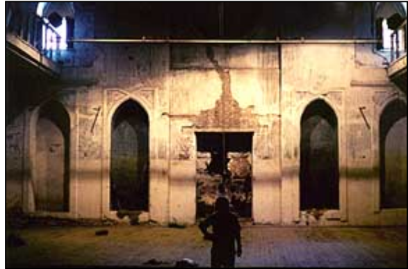
Tbilisi synagogue, now home to a popular theater

The Rachamim Society, founded in 1990, supplies financial and medical support and organizes care for Jewish cemeteries and synagogues. It serves as the umbrella organization for Ashkenazi Jews. The Association of Georgian Jews (Derekh Yehudi) promotes property restitution and hosts community programs. Its focus is regaining property rights to a 19 th century Ashkenazi synagogue that was converted into a club during the Communist era and later to a popular theater.