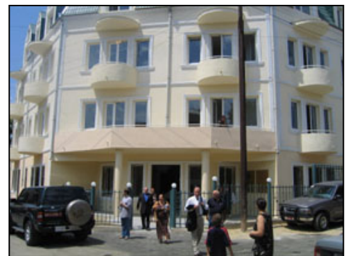
The "Jewish House"

Christian organizations have been supportive of the Jewish community as well. In January 2001, the Georgian Orthodox Church and Jewish community signed an agreement of mutual respect and support, continuing a tradition of warm interfaith relations in Georgia. In 2003, JDC opened a new "Jewish House" to house several of the community's organizations: the Hesed Eliyahu Charitable Center, the Jewish Cultural Center, Hillel-Tbilisi, the Institute of Social and Communal Workers, editorial headquarters of the Jewish newspapers, and the Office of the Georgian-Jewish Folk Dance and Song Ensemble. Several hundred people including Georgian government officials, the ambassadors from Israel and the United States, and leaders of the Jewish community, including NCSEJ, attended the dedication ceremony.